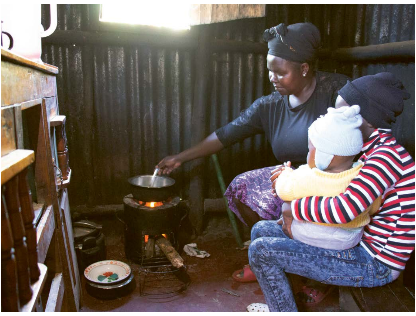
Family cooking on improved cookstove in Kenya