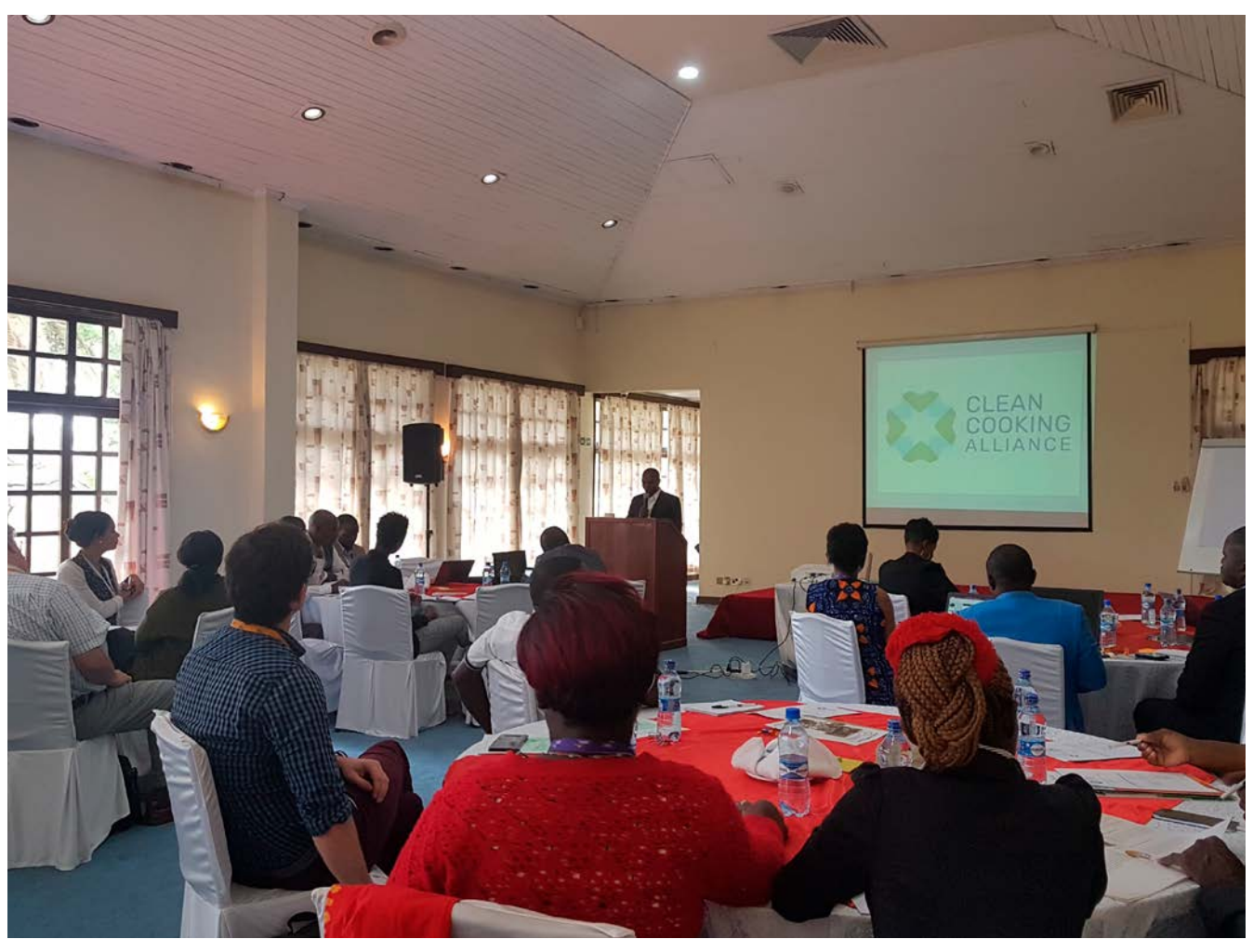
Social and behaviour change communication training at Safari Park @CCAK \,