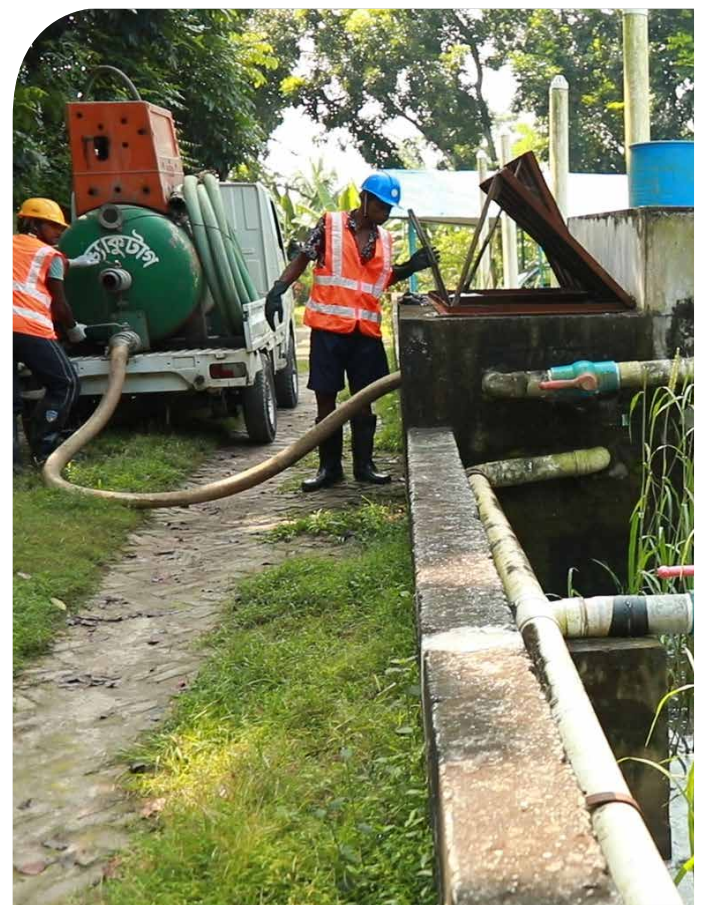
Photo: Emptiers at work at the SNV-supported faecal sludge treatment plant in Jhenaidah Bangladesh (SNV).