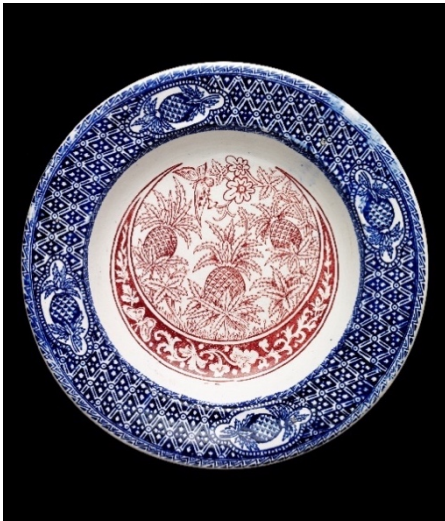
Plate with 'Buah Nanas' (meaning 'Pineapple') pattern, by J. & M.P. Bell & Co. Ltd

In the 1880s Scotland became a major exporter of ceramics to Asia. Based in Glasgow, R. Cochran & Co. and J. & M.P. Bell & Co. were two of the most important potteries supplying products to these new, growing markets.