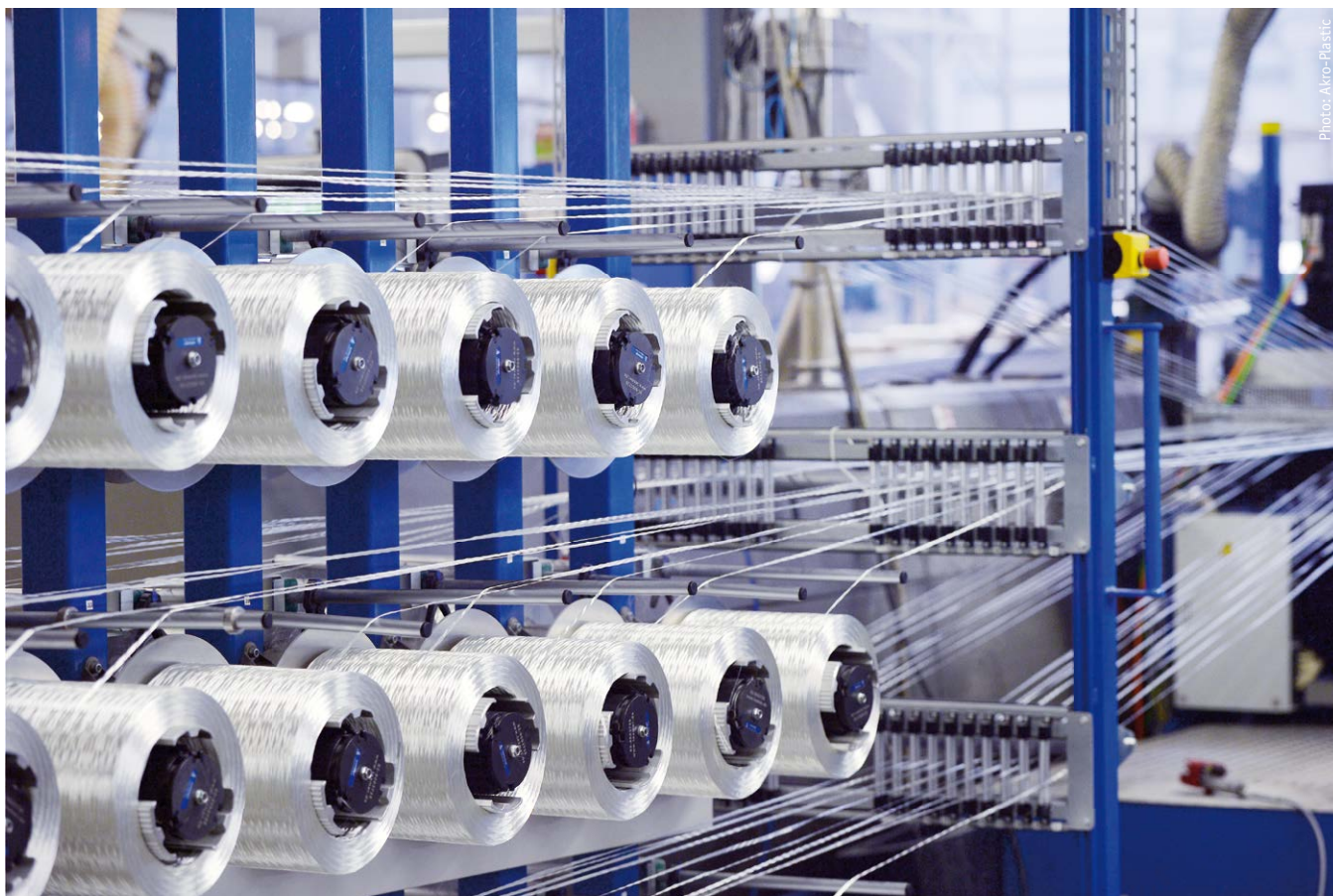
Coil unwinding from the outside prevents twisting of the fibre strands and thus ensures better feeding into the impregnation die.