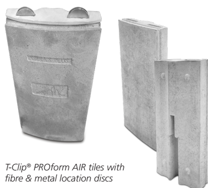
T-Clip® PROform AIR tiles with fibre & metal location discs

All intellectual property rights related to the design of the T-Clip product, as well as the trademarks T-Clip, SAINT-GOBAIN and the Skyline logo, are owned by the Saint-Gobain Group.