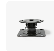
Slope Corrector (Side)