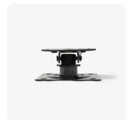
Slope Corrector (Front)