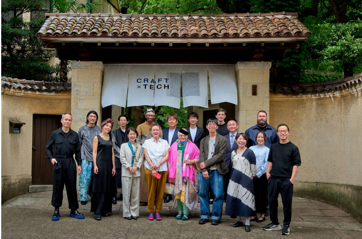
Above: Group image of the creatives involved in the Craft x Tech Tokai Project.