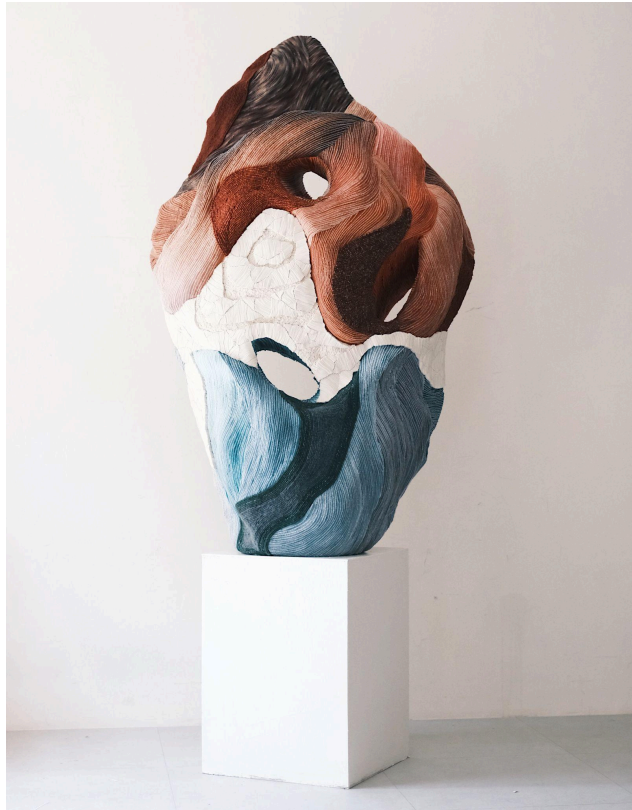
Above: Soft Monolith by Shuang Xi, part of Reviving Craft - Chinese Intangible Cultural Heritage and Contemporary Design, by Sun Media Group