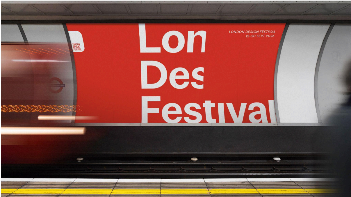
Above: Framing LDF 2026

1st July | Today, at the Isla Terrace at The Standard, London Design Festival announced its 24th edition, taking place from the 12 - 20 September 2026 . The event is a defining moment for UK design, and a cornerstone of the global cultural calendar. Across the city, the event will showcase Landmark Installations, Special Projects, the Global Design Forum, the London Design Medals, Fairs and a Partner Programme across eleven Design Districts. London Design Festival continues to champion both emerging and established talent, fostering collaboration and innovation across the international design community.