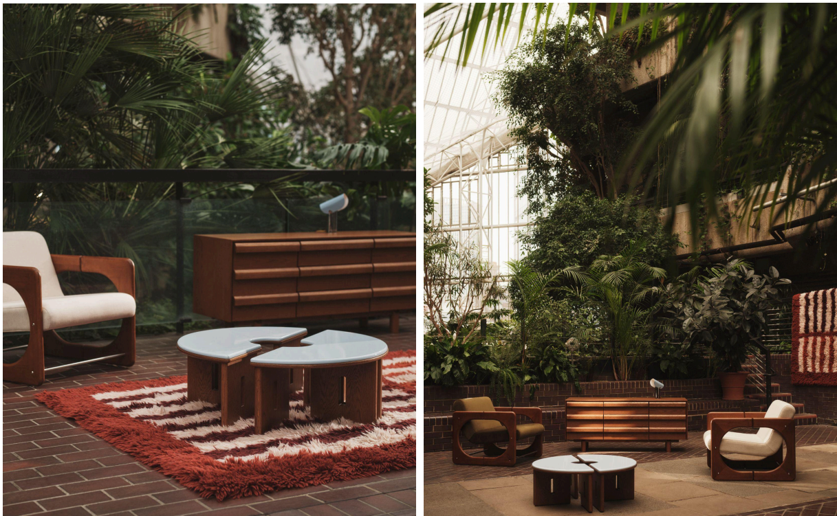
Above: the MADE x Barbican collection.