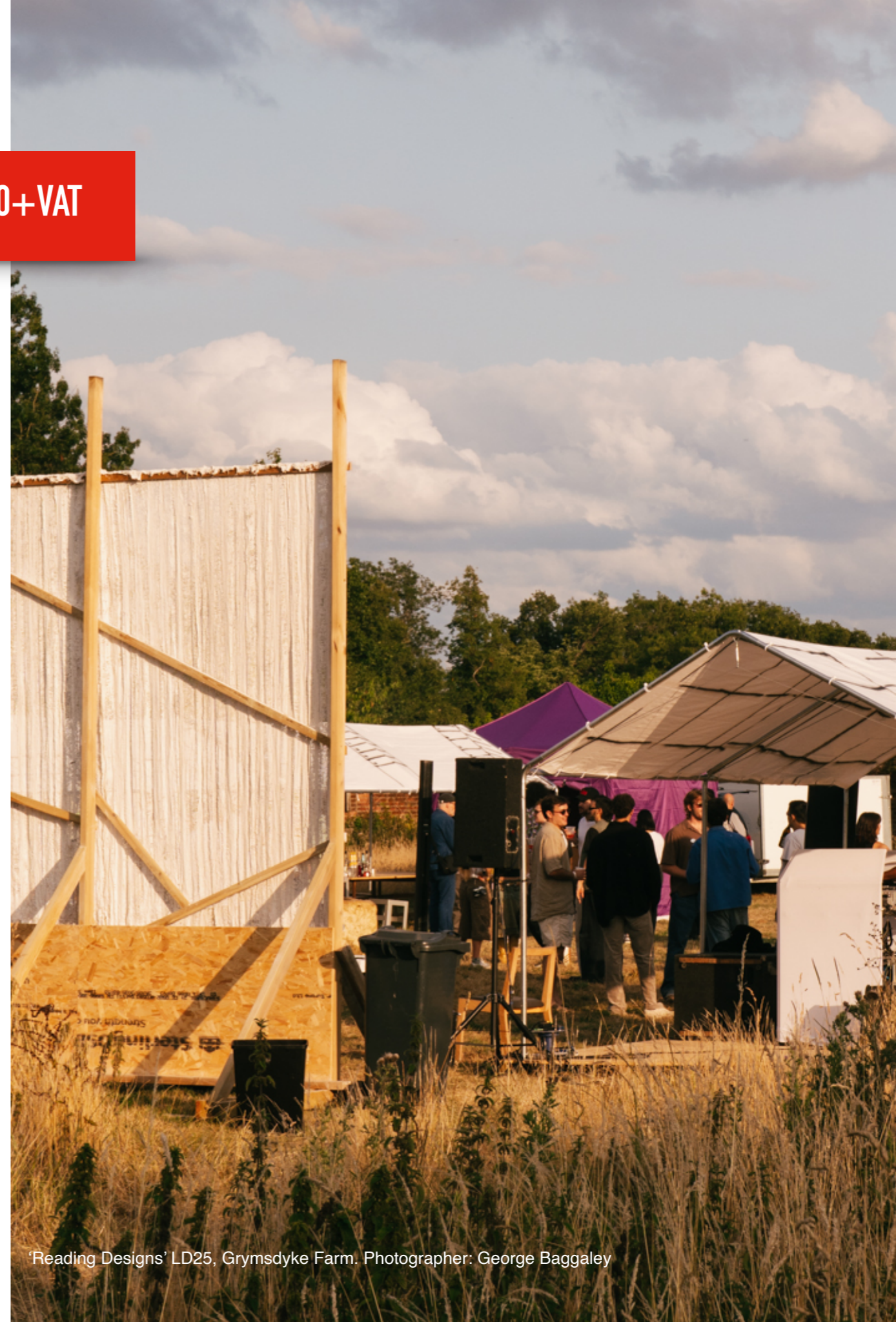
‘Reading Designs’ LD25, Grymsdyke Farm.