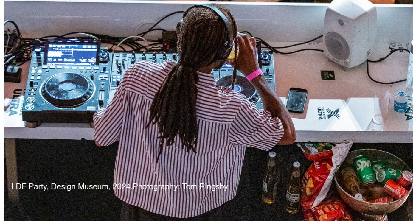
LDF Party, Design Museum, 2024.