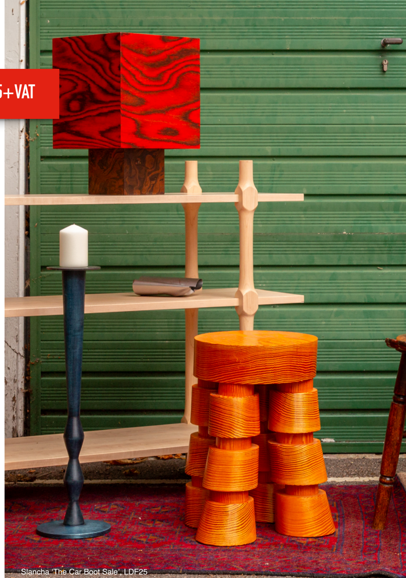
Slanča 'The Car Boot Sale', LDF25