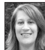
Marlo Schulz Urban Scholastic Center