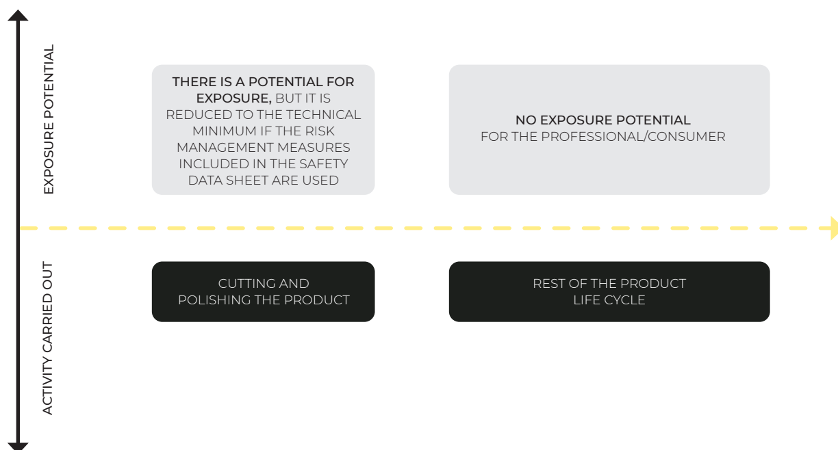
Figure 1. Relationship between product life cycle and potential for product exposure