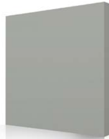
ICE GRAY 6504