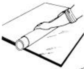
Figure 3 -- Masking Paper Rolled On to Tube