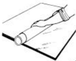
Figure 3 -- Masking Paper Rolled Onto Tube