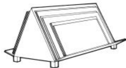
Figure 1 – A-Frame Storage Rack

Boxed AcryClear™ GPA Sheet stock may be stacked to conserve warehouse space. Larger sized sheets are frequently stored in “A” frame racks (see Figure 1), in their shipping containers, for the same reason and for ease of access when needed. Single sheets should always be stored in racks. In the racks, sheets should be adequately supported to prevent bowing.