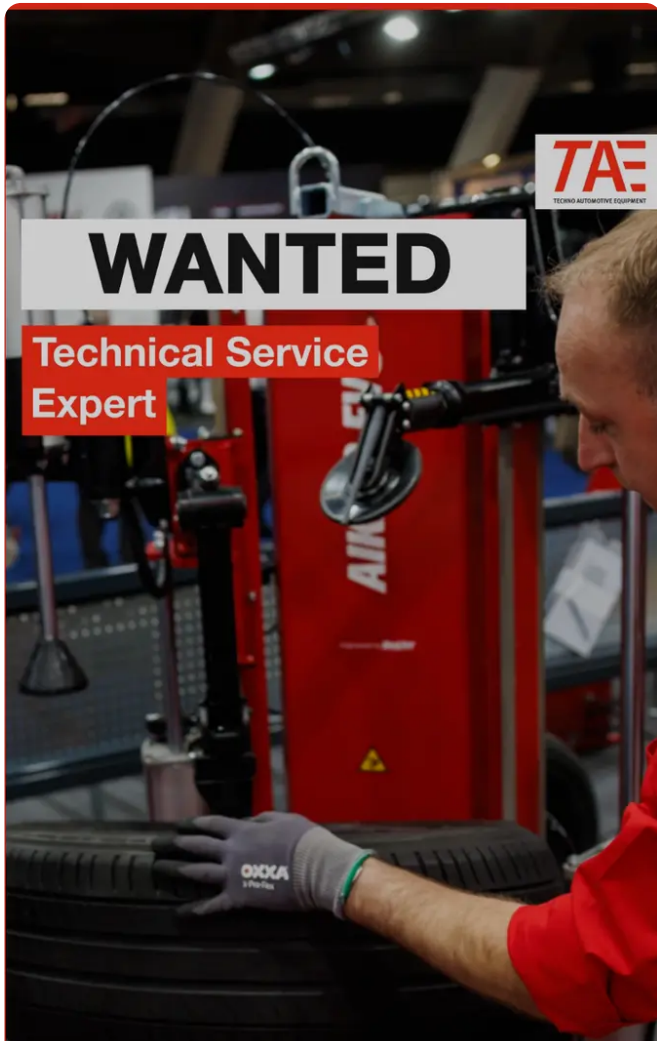
Technical Service Expert