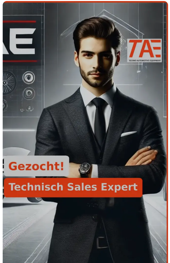
Technisch Sales Expert