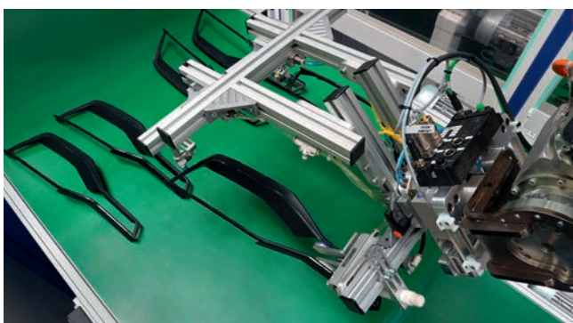
Fig. 2. The new weighing system for process assurance is already in use at ZKW

Following this positive experience, the system is now being tested in a critical application with larger parts with a shot weight of 750g. "We expect a significant increase in efficiency here due to locating the inspection process for the parts directly in the on-going production process," says Benedikt. ■