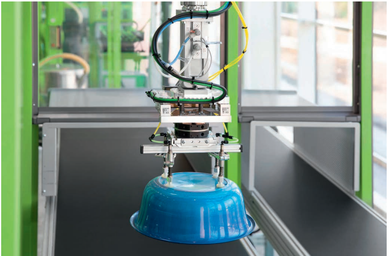
Thanks to the new development, the component weight can be recorded inline

In injection molding, the component weight reflects the process consistency and the component quality. Components are therefore often weighed manually after production or automatically placed on a scale and picked up again. Engel has now developed a high-precision load cell for inline weight measurement that can be integrated directly between the rotary axes and the end-of-arm tooling of a linear robot. This allows the component weight to be recorded without loss of time during on-going production, and without having to deposit the components for weighing.