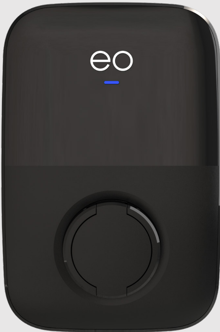
EO GENIUS 2

DESIGNED AND MANUFACTURED IN THE UNITED KINGDOM.