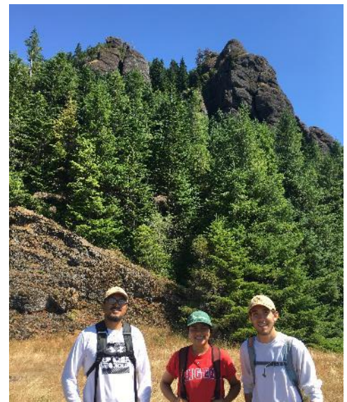
Old logging roads provide hiking access.