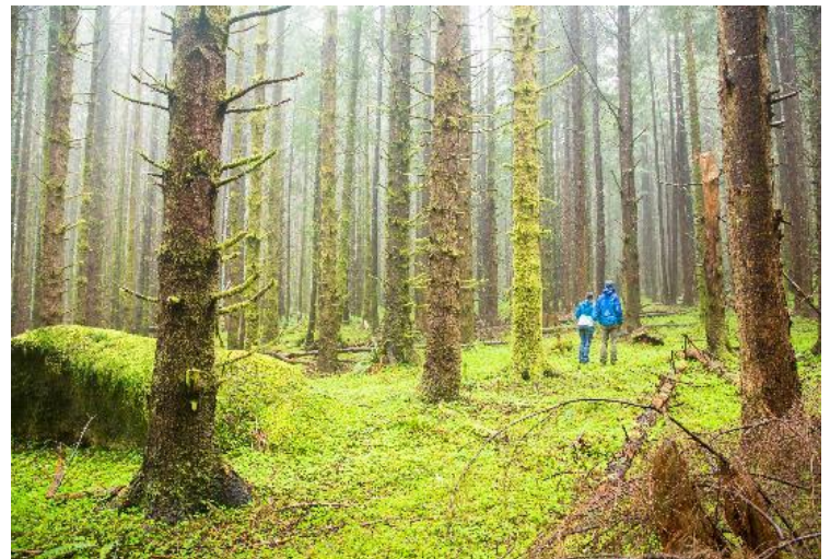
Fog condensing on trees is a critical water source in coastal watersheds; managing for old growth will enhance this process.