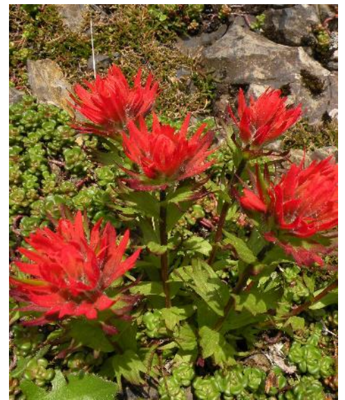
The federally listed Chambers paintbrush exists only on North Coast rocky peaks.