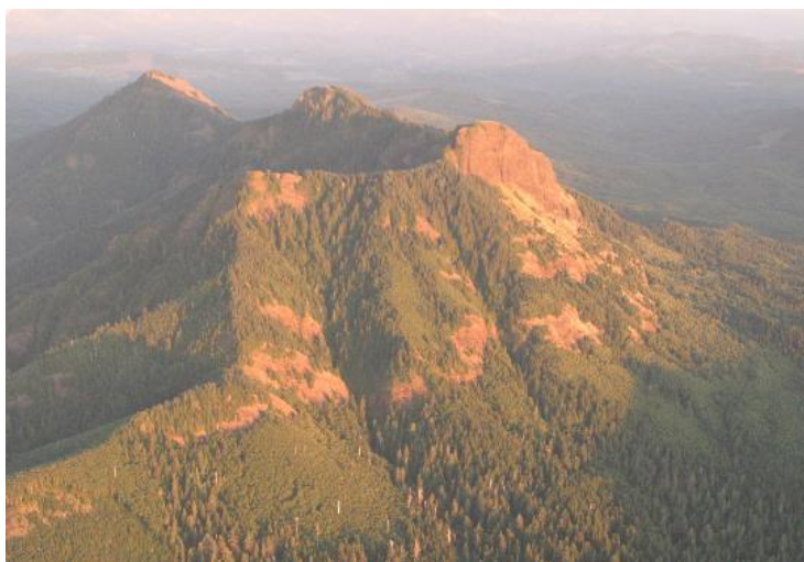
Onion Peak climbs precipitously to 3,057 feet, creating a wide range of microclimates and niches.