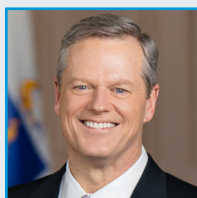
Governor Charlie Baker The Commonwealth of Massachusetts