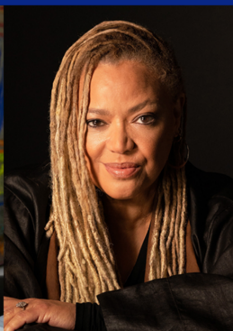
Kasi Lemmons TV & Film