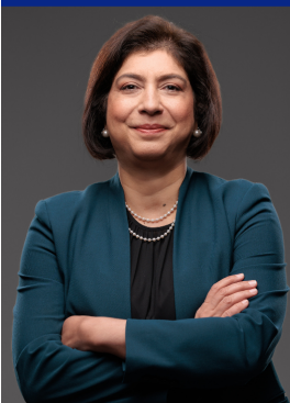
Vertex Pharmaceuticals Civic Responsibility