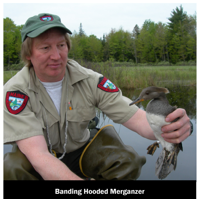
Banding Hooded Merganser