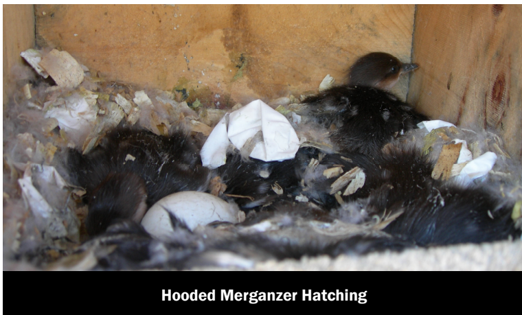
Hooded Merganser Hatching