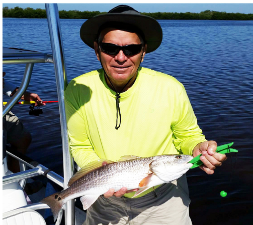
20+” redfish kept for supper