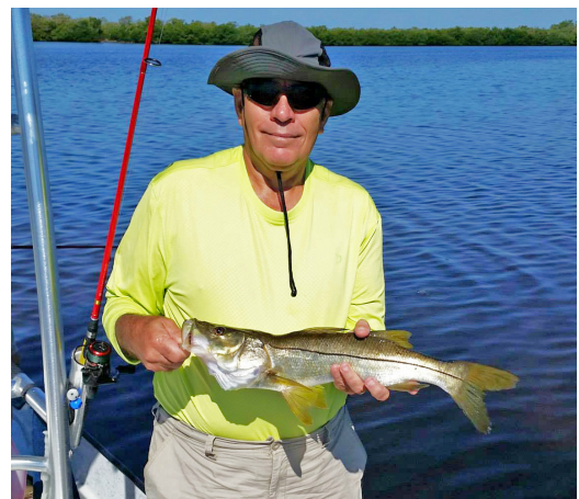
24” snook that was too small to keep